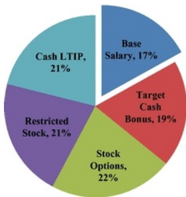
CEO Pay Mix